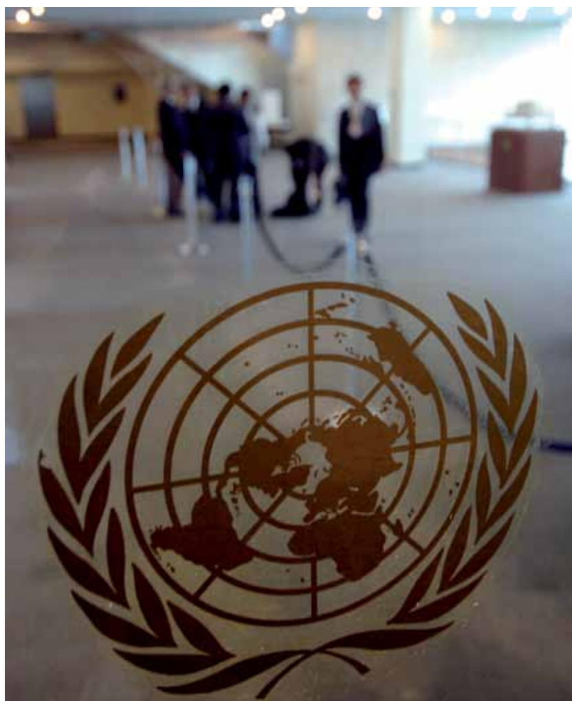
UN symbol.

** http://www.who.int/pmnch/activities/jointactionplan/en/index.html