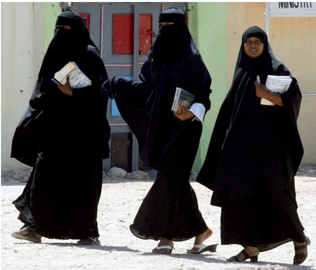
Young women covered in traditional Muslim dress walk home from school in Hargeisa, Somalia.

This involves incorporating sustainable development into the policies of developing countries and preventing the exhaustion of their natural resources. The goal also aims to halve the number of people without access to safe drinking water and basic sanitation. In ACP countries, ACP-EU facilities help to improve people's access to clean water and electricity. Despite huge obstacles, the goal for