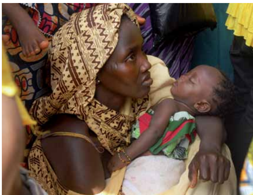
Sierra Leonean woman and child attend the April launch of the free medical care programme, Princess Christian Maternity Hospital, Freetown.