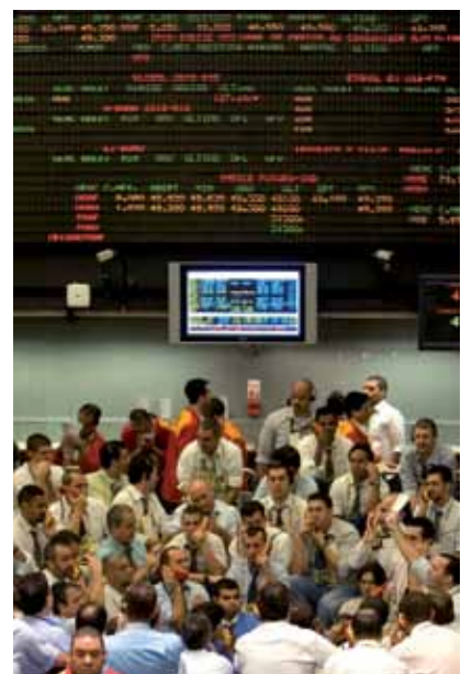
The bund Shanghai; commuters in Mumbai; stock exchange in Sao Paulo.