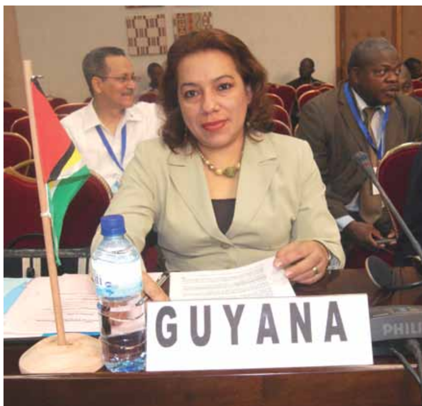
Carolyn Rodrigues-Birkett, MP, Minister of Foreign Affairs, Guyana and President of the ACP Council.

W ith five years to go before the agreed 2015 deadline for the Millennium Development Goals (MDGs), the African, Caribbean and Pacific (ACP) Group will reinvigorate concerted efforts to address all MDG targets in a comprehensive manner. The ACP is particularly mindful of those countries and targets most off track and shall be paying particular attention to those communities most vulnerable and marginalised.