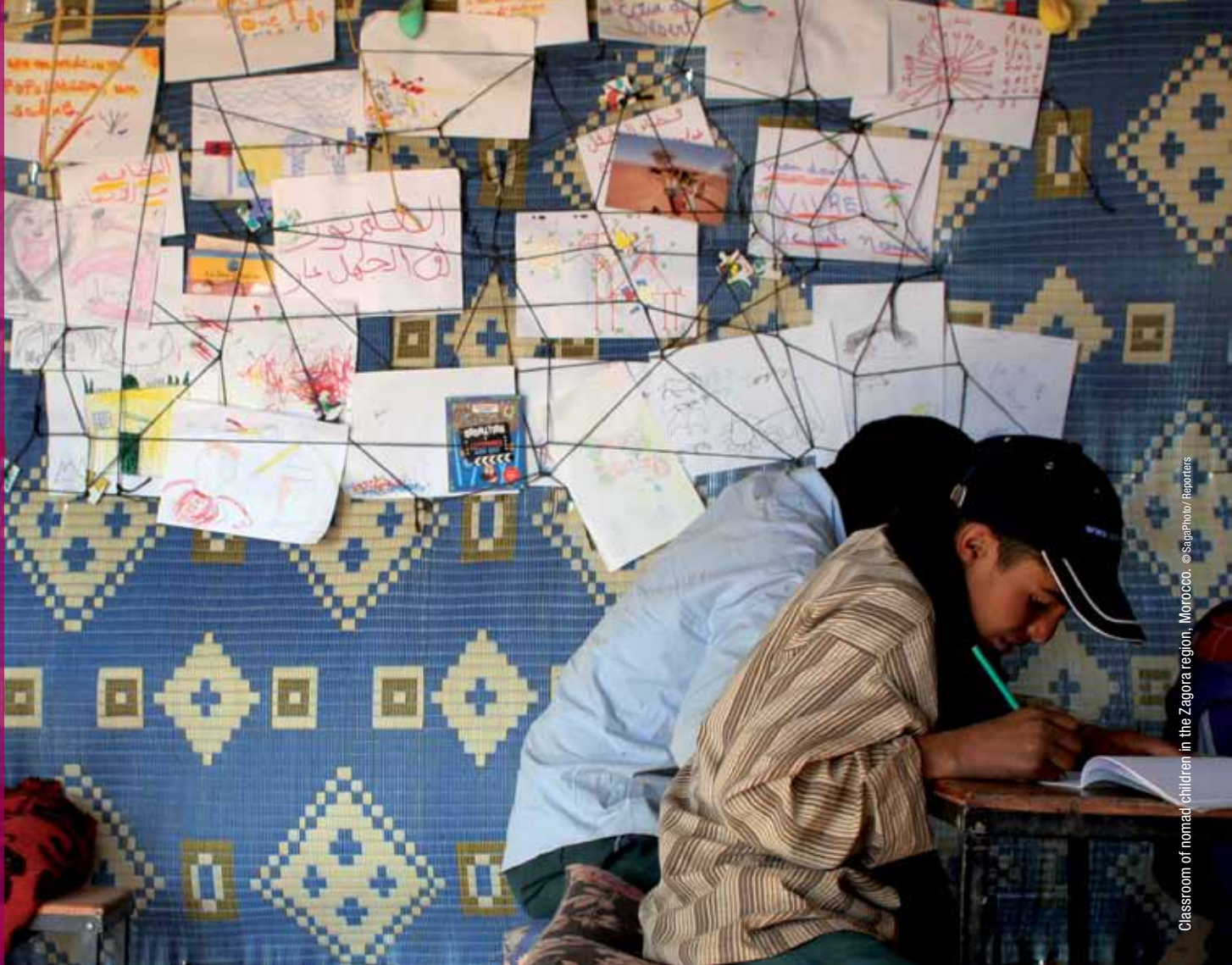
Classroom of nomad children in the Zagora region, Morocco.