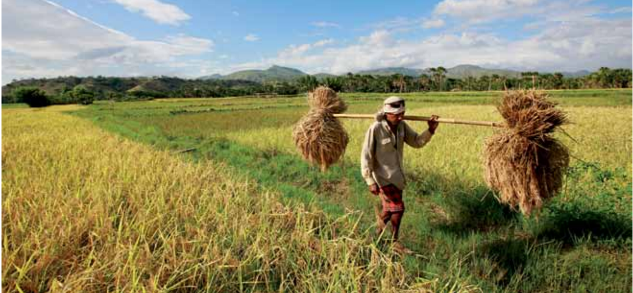
Timor-Leste farmer carries away crops destroyed by heavy rains.

From another angle, the OECD's view was expressed by the director of the Development Assistance Committee, Eckhard Deutscher, who made the point that "the biggest challenge the EU's development aspirations are facing is the lack of policy coherence... Trade, development, agriculture and environment policies are simply out of sync with regard to developing countries."*