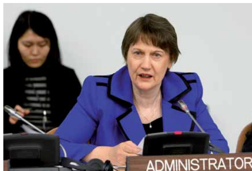
Helen Clark addresses the 16th session of the High-Level Committee for South-South Cooperation.

The world is within reach of a number of the MDGs at the global level. When large countries like China and Brazil are on