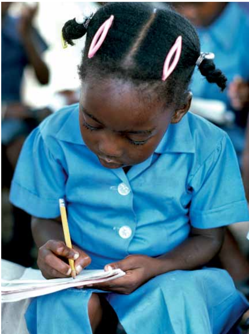
Outdoor class run by the local community for the children of squatters in Negril, Jamaica.